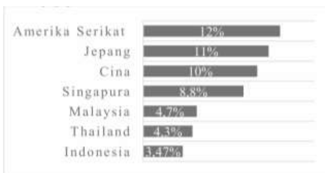
Figure 1. Entrepreneurial Ratio in 2024

The low awareness of Indonesian society about the importance of entrepreneurship is still low compared to other countries (Dihni, 2023). The ratio of entrepreneurs to the total population in Indonesia is still low, one of which is that a country must have at least 5% of entrepreneurs from its total population to be considered a developed country (Nadzirah, 2023).